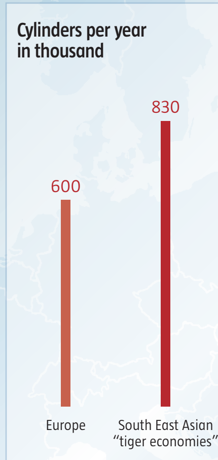
Cylinders per year in thousand